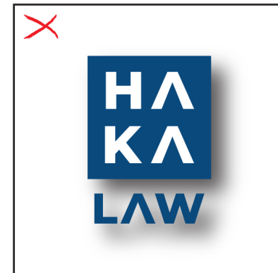
DO NOT APPLY DROP SHADOW OR REFLECTION