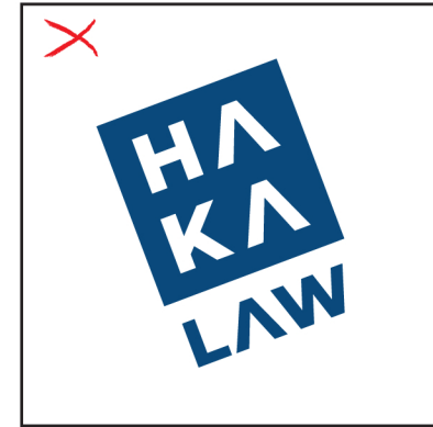
DO NOT ROTATE