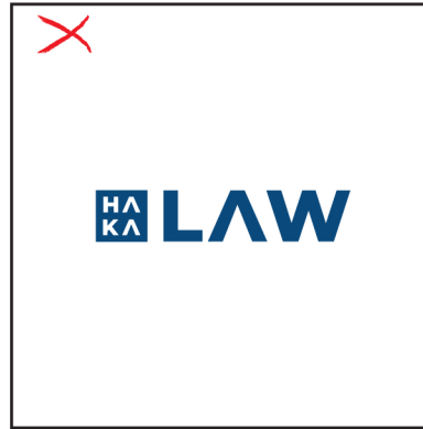
DO NOT REARRANGE LAYOUT